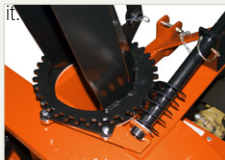
Manual Chute Rotator

Chute Rotation available in Manual, Hydraulic, or Electric. The chute rotates so you can direct the snow right where you want it.