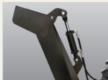
Tilt can be easily adjusted manually, or with electric or hydraulic option.