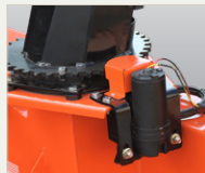
Optional Electric Rotator