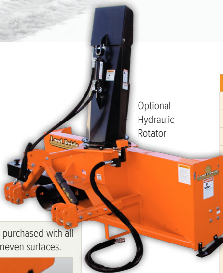
Optional Hydraulic Rotator

Designed for tractors ranging from 43 to 105 HP with Cat. 1 or Cat. 2 hitches, the SB2584 Snow Blowers are designed to remove snow from parking lots, walking paths, homeowner lanes, and driveways. The 84" width, 16" auger, and 24" impeller make short work of the largest snow removal tasks.