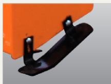
Outer Skid Shoe

Chute Rotation available in Manual, Hydraulic, or Electric. The chute rotates so you can direct the snow right where you want it.